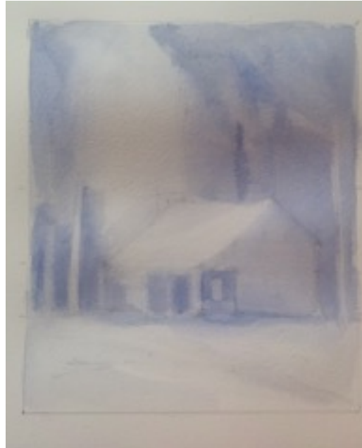
Left: after the blue washes had been applied and the areas lifted off where I wanted paler areas, I left the painting to dry before the next colour went on.

Here the painting has had more of the same wash applied as it dries, this creates darker areas. It is important to note that I made enough colour for all these stages and that it was applied whilst looking at the black and white photo. The lighter areas are lifted off with the damp brush. Spend time on both points