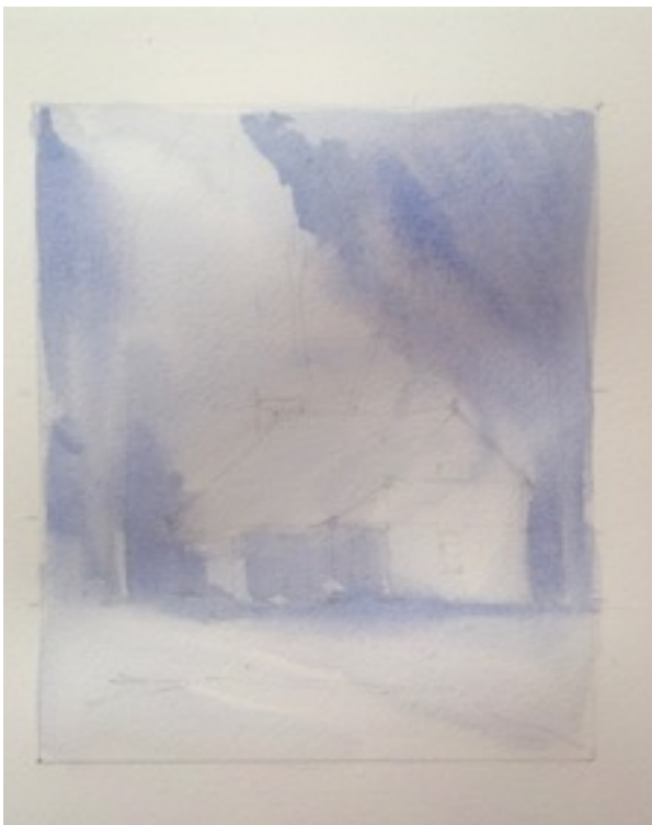
Above: ultramarine deep blue applied to log cabin drawing in various strengths. Pale blue watery areas left for later colour but you can lift off, it is your choice

Here the painting has had more of the same wash applied as it dries, this creates darker areas. It is important to note that I made enough colour for all these stages and that it was applied whilst looking at the black and white photo. The lighter areas are lifted off with the damp brush. Spend time on both points